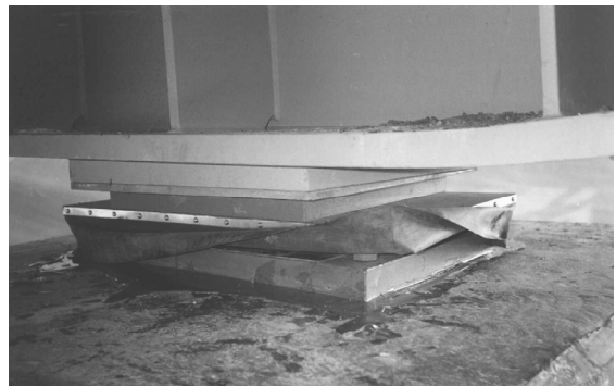
Figure 3 Guided bearing (with skirt)

Whilst sliding bearings are best fixed with the sliding surface facing downward so that extraneous material cannot fall onto the sliding surface, they are often mounted 'inverted' to avoid eccentric loading to the bearing stiffener. In such cases skirts should be provided (to prevent dirt, etc. reaching the upward facing sliding surface). These can usually be attached to the upper part of the bearing, rather than the girder flange. See Figure 3.