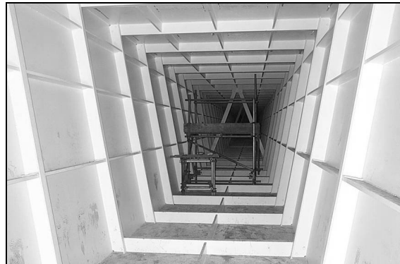
Figure 1 Internal view of a steel box girder showing use of longitudinal stiffeners

Longitudinal stiffeners typically take the form of longitudinal flats, bulb flats, Tees or trough sections welded to the inner surface of the plate. Extensive use of longitudinal stiffeners typically enables the thickness of the plates forming the walls of the box to be minimized. Taken to the extreme, this strategy will result in a minimum weight box with high fabrication costs.