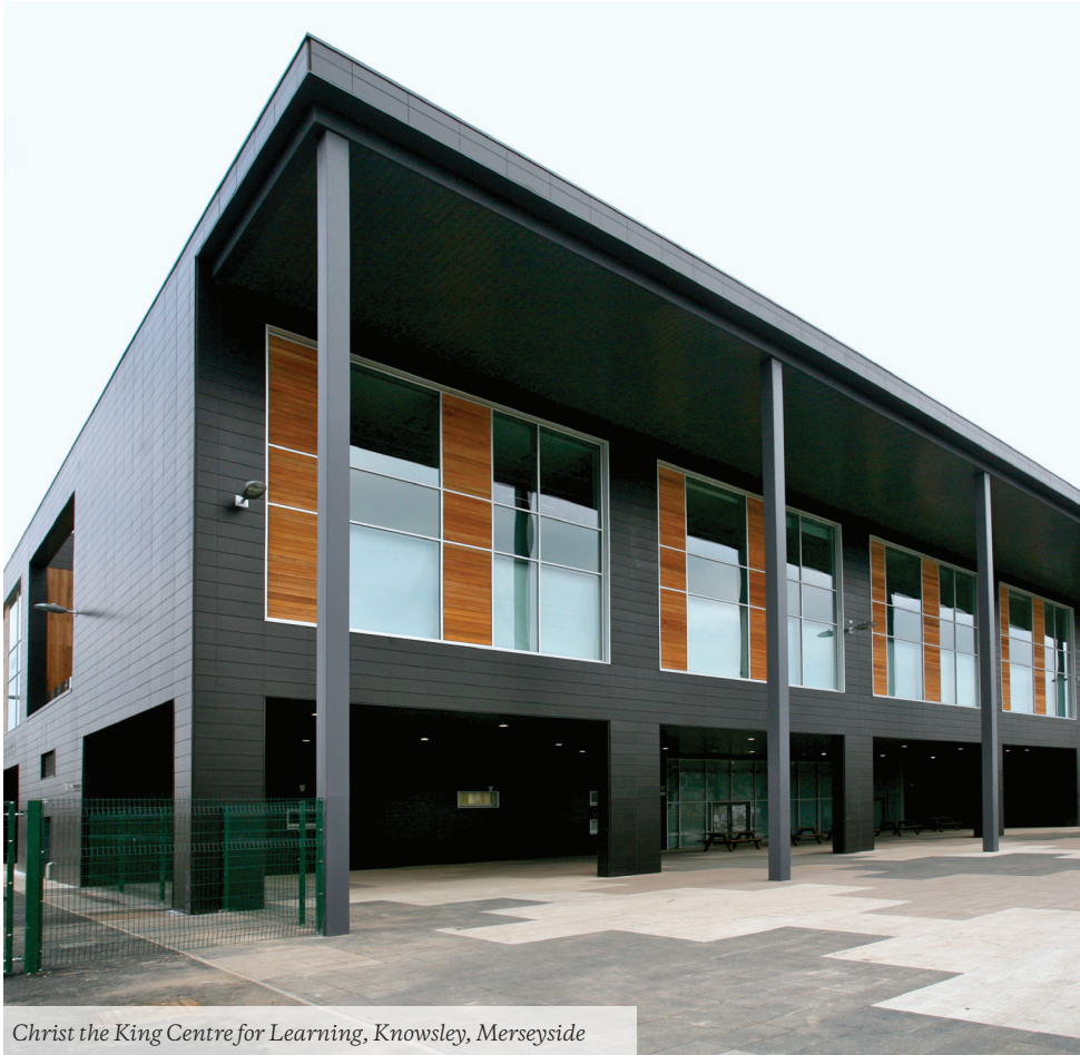
Christ the King Centre for Learning, Knowsley, Merseyside