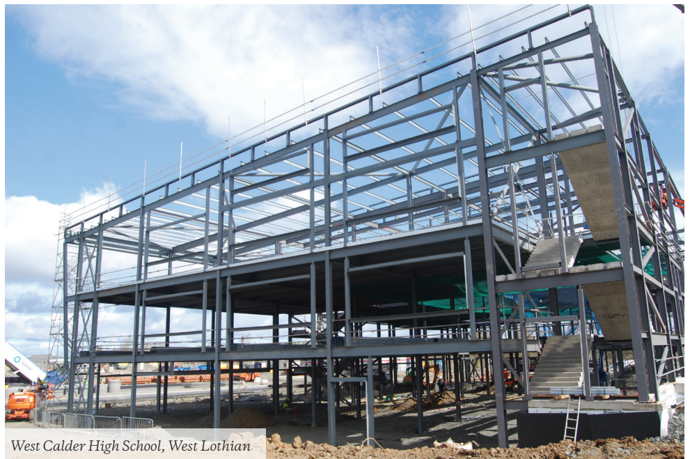
West Calder High School, West Lothian

The emphasis on ICT requirements including the future proofing of systems can put additional constraints on the building. This can result in