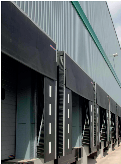
Distribution warehouse, ProLogis Park, Stoke-on-Trent

These five projects were originally part of the Target Zero study conducted by a consortium of organisations including Tata Steel, Aecom, SCI, Cyril Sweett and the BCSA in 2010 to provide guidance on the design and construction of sustainable, low- and zero-carbon buildings in the UK. The cost models for these five projects have been reviewed and updated as part of the Costing Steelwork series. The latest cost models as of Q4 2018 are presented here.