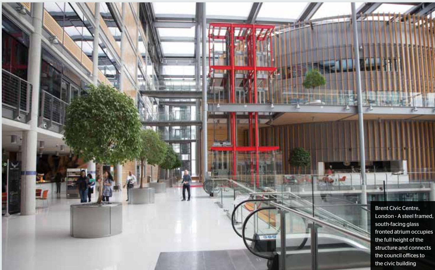
Brent Civic Centre, London - A steel framed, south-facing glass fronted atrium occupies the full height of the structure and connects the council offices to the civic building