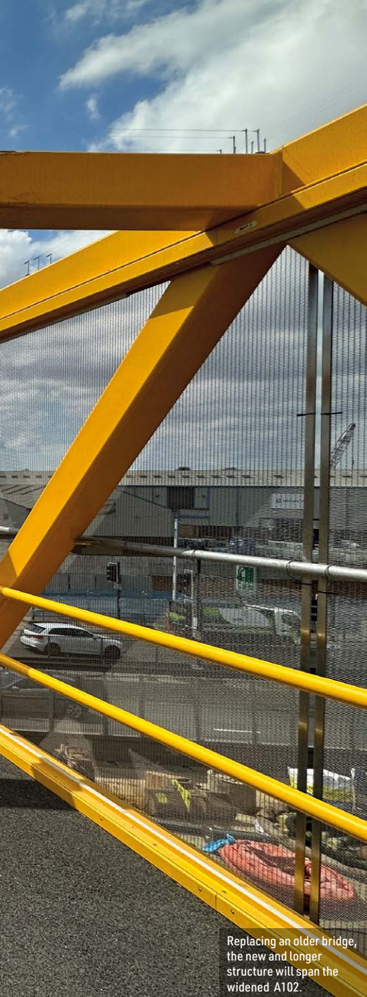
Replacing an older bridge, the new and longer structure will span the widened A102.