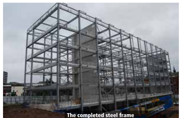
The completed steel frame