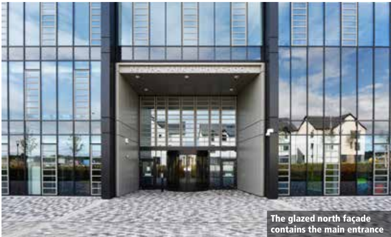
The glazed north façade contains the main entrance

the aforementioned classrooms around much of the perimeter, with the western elevation also accommodating a sports hall, a smaller games hall and a gym. The sports hall is a double-height braced box with spans of 20m.