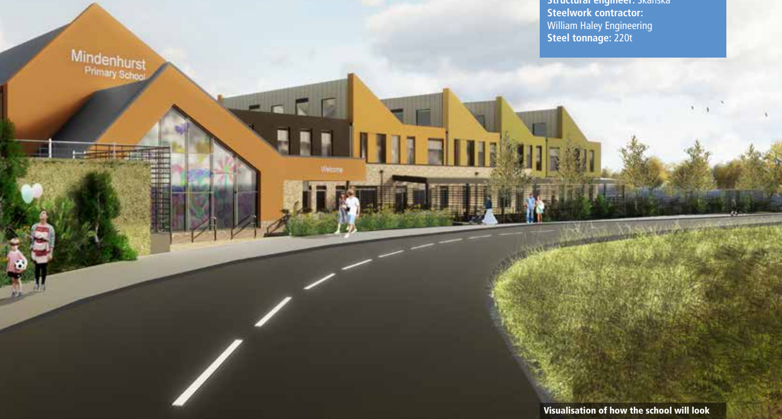
Visualisation of how the school will look

ridge, the north side is formed with a single rafter that slopes outward and downwards to its supporting column.