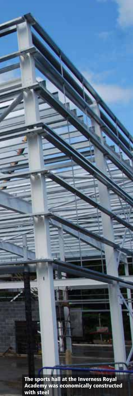
The sports hall at the Inverness Royal Academy was economically constructed with steel

steel can be prefabricated into modular elements - but also for shallow floor construction which can aid vibration and acoustic performance.