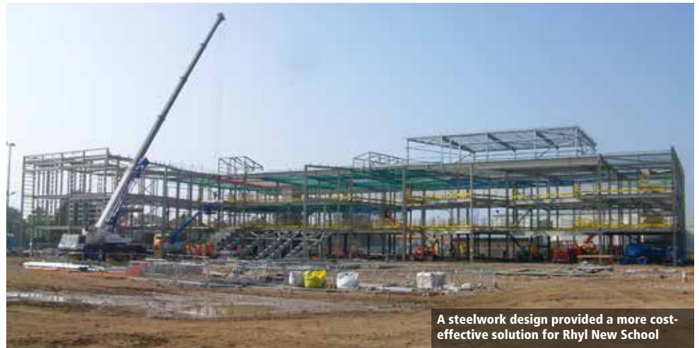
A steelwork design provided a more cost-effective solution for Rhyll New School

Atriums and long linking streets for larger education buildings are parts of a construction project that are invariably framed with steel. Both of these features rely on long open areas where steel construction is the obvious choice.