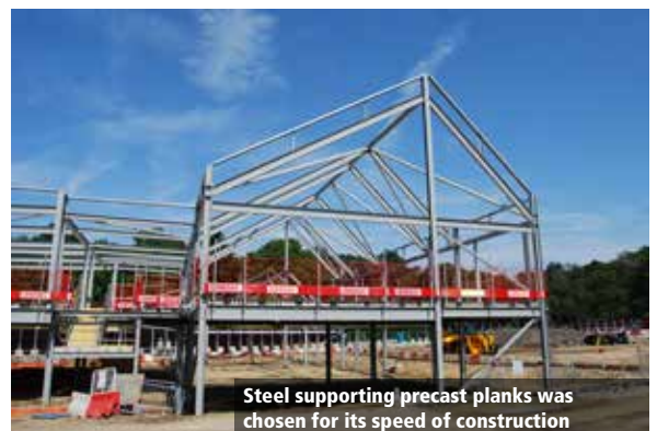
Steel supporting precast planks was chosen for its speed of construction

"Also the overall design for this eye-catching structure could not have been done in any material other than steel, because of the shape and length of spans."