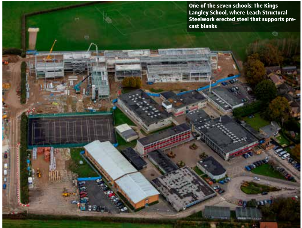
One of the seven schools: The Kings Langley School, where Leach Structural Steelwork erected steel that supports precast blanks

In buildings such as schools, which are intensively used during the day, temperatures can build up to uncomfortable levels due to solar gain and internal heat gains from the occupants, computers and other equipment. If the soffit of the floor slab is left exposed, the warm air rises and some of the heat is soaked up by the concrete.