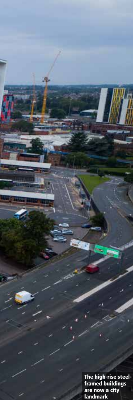
The high-rise steel-framed buildings are now a city landmark