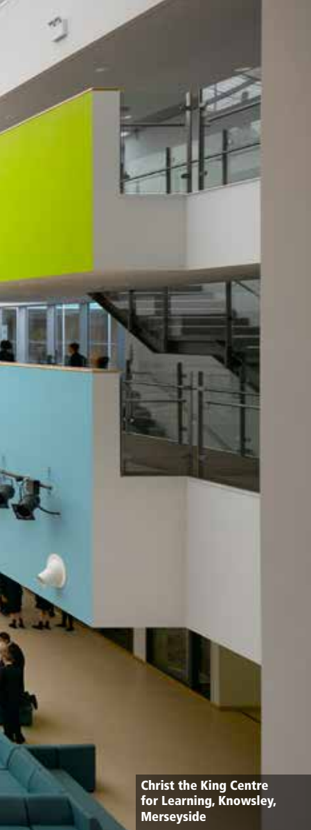
Christ the King Centre for Learning, Knowsley, Merseyside

English universities experienced a 4% funding decline between 2016-17 and 2017-18, with capital funding having declined by over 25% over that period. Some universities have turned to the capital markets to fund infrastructure investments.