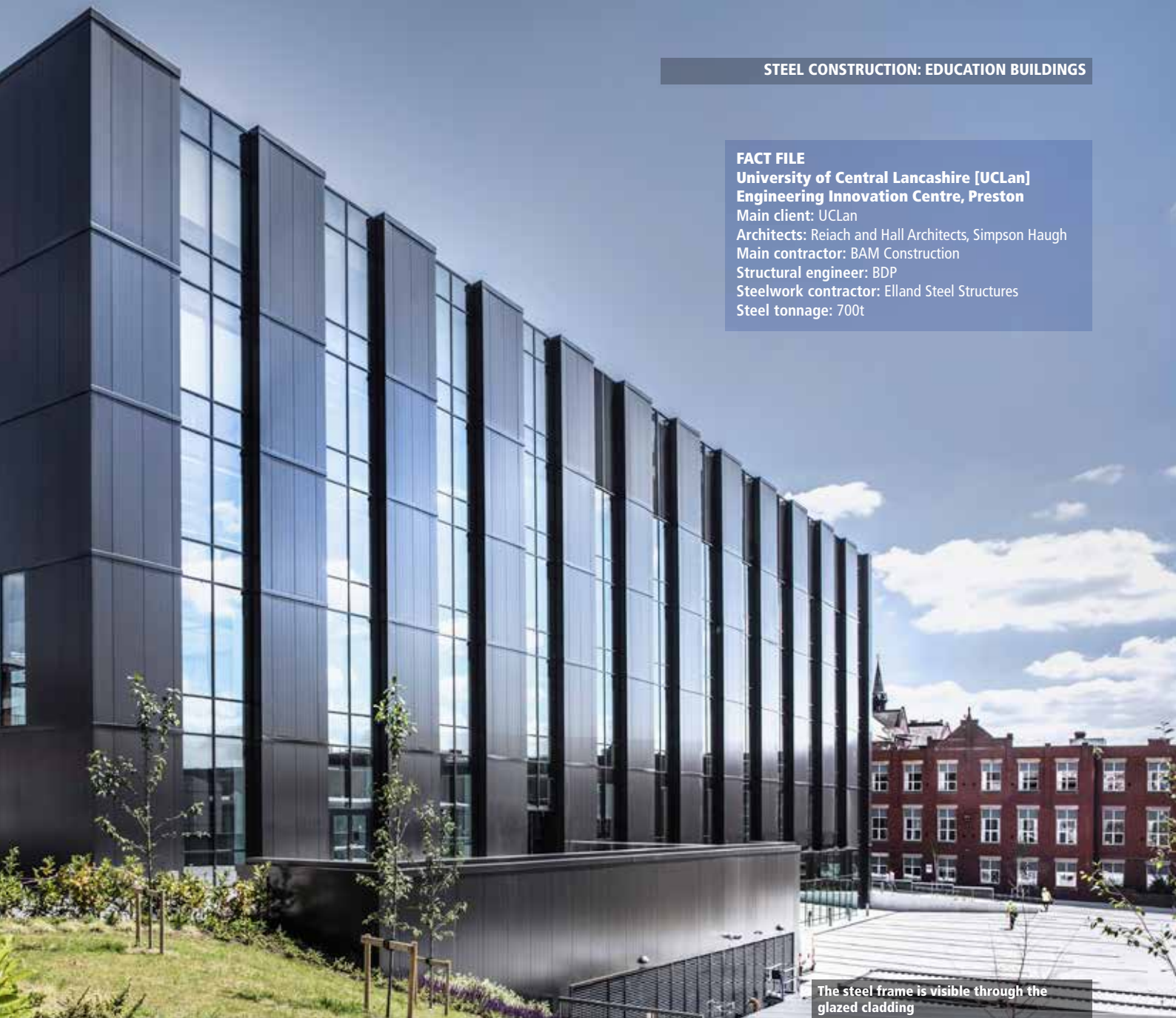
The steel frame is visible through the glazed cladding

building structure ‘as the engineering of the building becomes the architecture.’