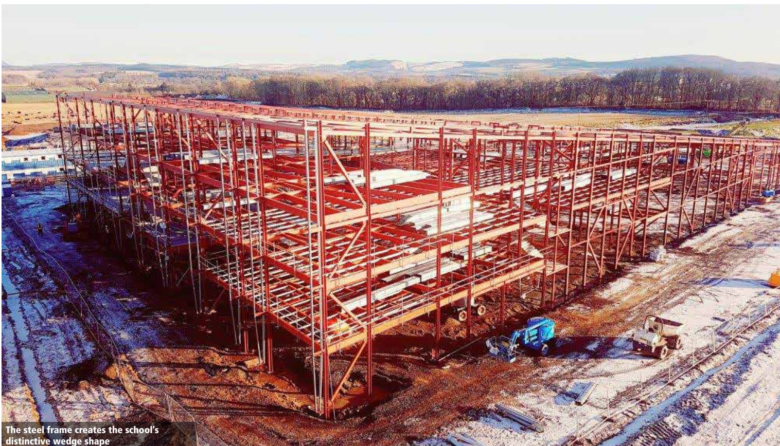
The steel frame creates the school's distinctive wedge shape