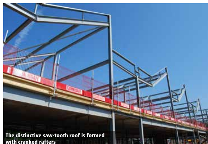
The distinctive saw-tooth roof is formed with cranked rafters