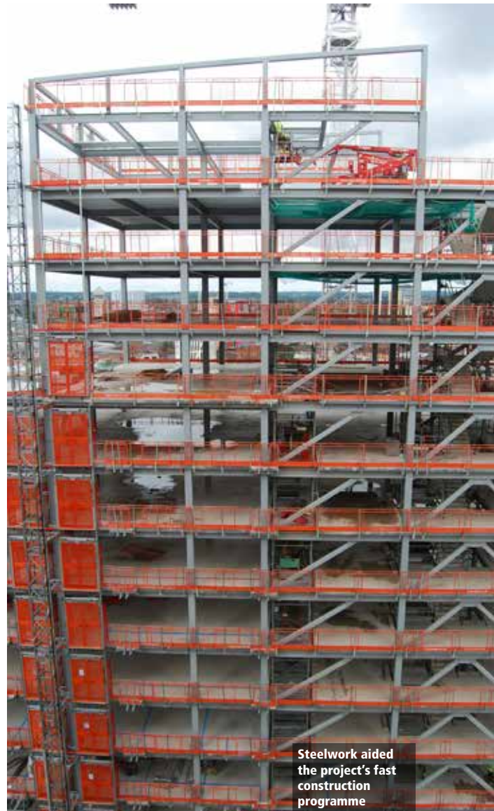
Steelwork aided the project's fast construction programme

Meanwhile, perimeter columns are generally set at 6m or 7m intervals, with