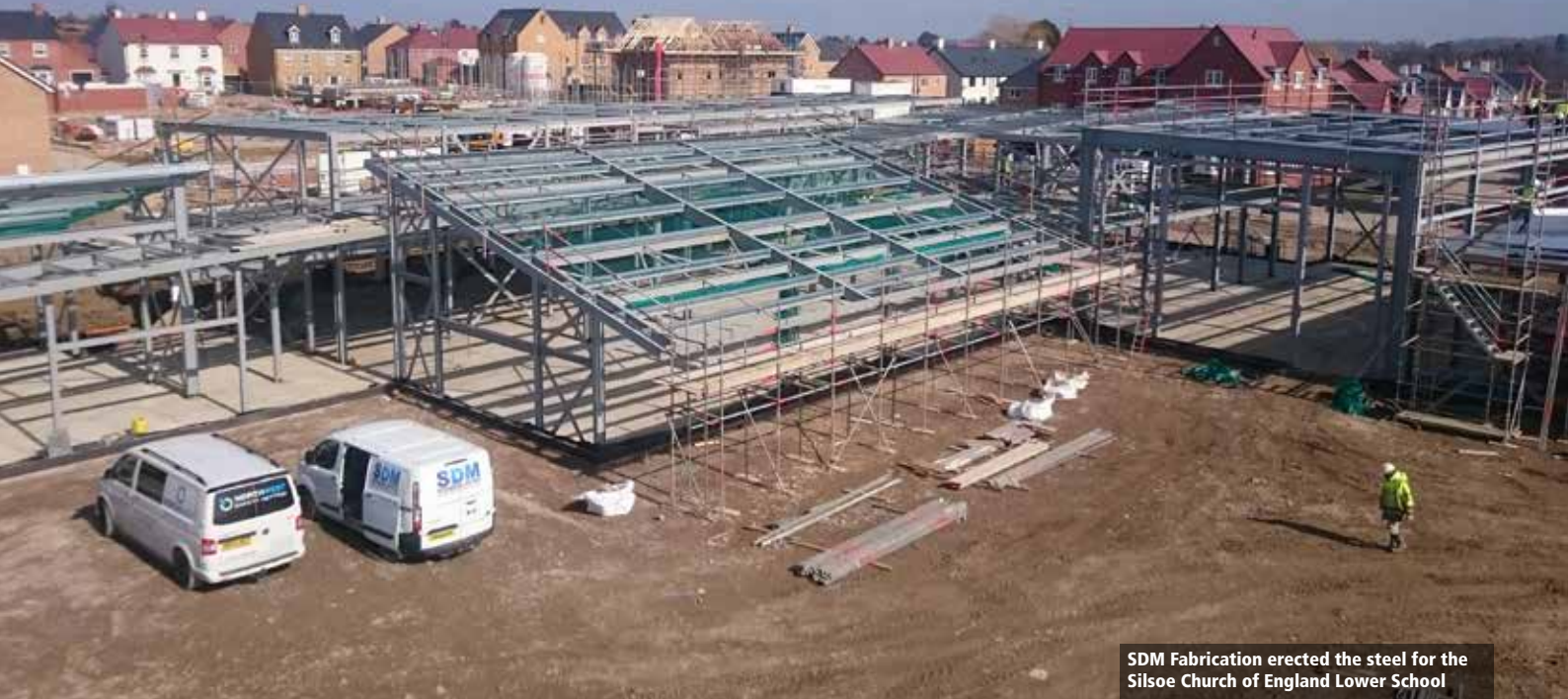
SDM Fabrication erected the steel for the Silsoe Church of England Lower School