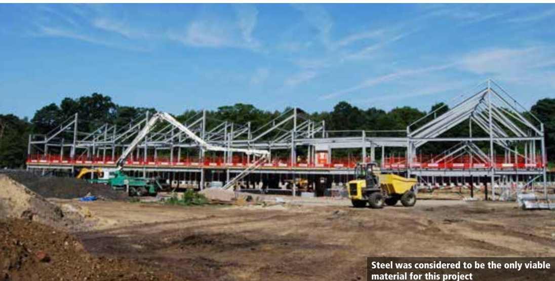
Steel was considered to be the only viable material for this project

The roof is formed with a series of cranked south-facing rafters, with a bolted knuckle joint, that forms an inclined section from two separate steel members. Completing each saw-tooth