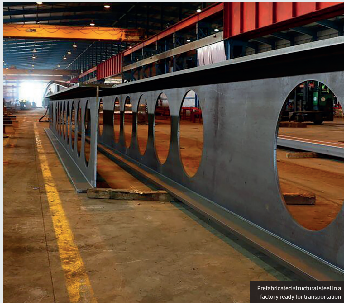
Prefabricated structural steel in a factory ready for transportation