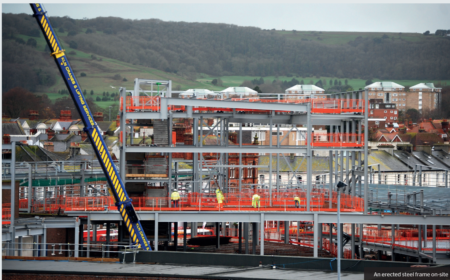
An erected steel frame on-site