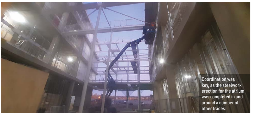
Coordination was key, as the steelwork erection for the atrium was completed in and around a number of other trades.