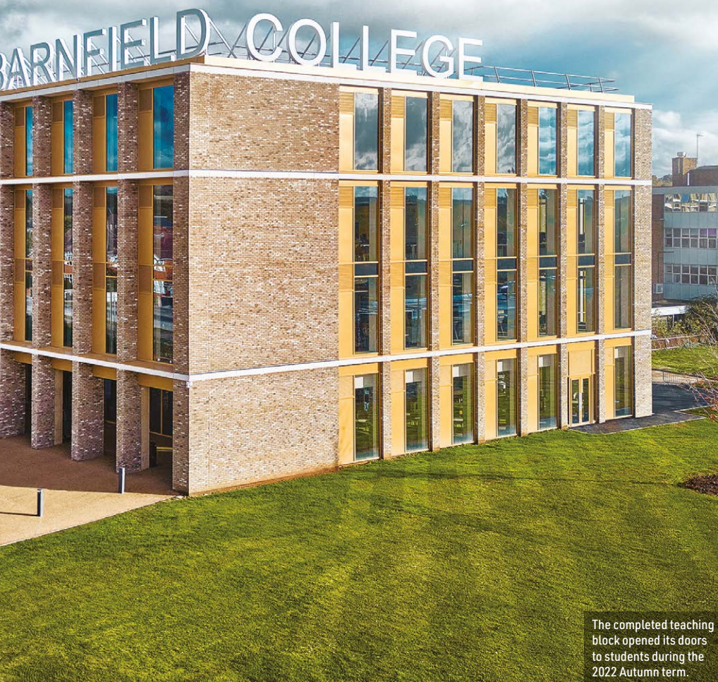
The completed teaching block opened its doors to students during the 2022 Autumn term.