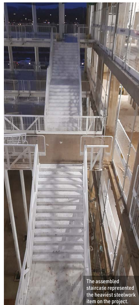
The assembled staircase represented the heaviest steelwork item on the project.

which will help local businesses, people and places to thrive.