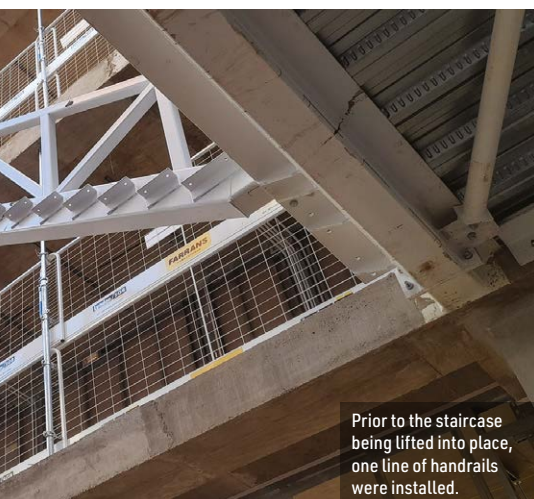
Prior to the staircase being lifted into place, one line of handrails were installed.

The ladder frames are positioned in every bay and support brickwork piers around the structure. The frames also support two horizontal bands of GRP