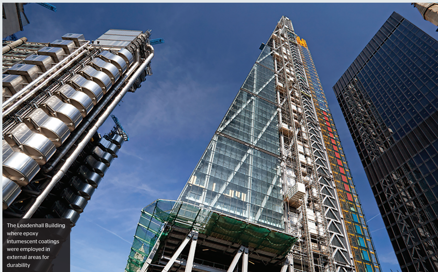
The Leadenhall Building where epoxy intumescent coatings were employed in external areas for durability

In England the minimum period of fire resistance varies depending on the purpose and height of the building. For open-sided car parks, the minimum period of fire resistance is 15 minutes; for offices over 30m high with sprinklers it is 120 minutes.