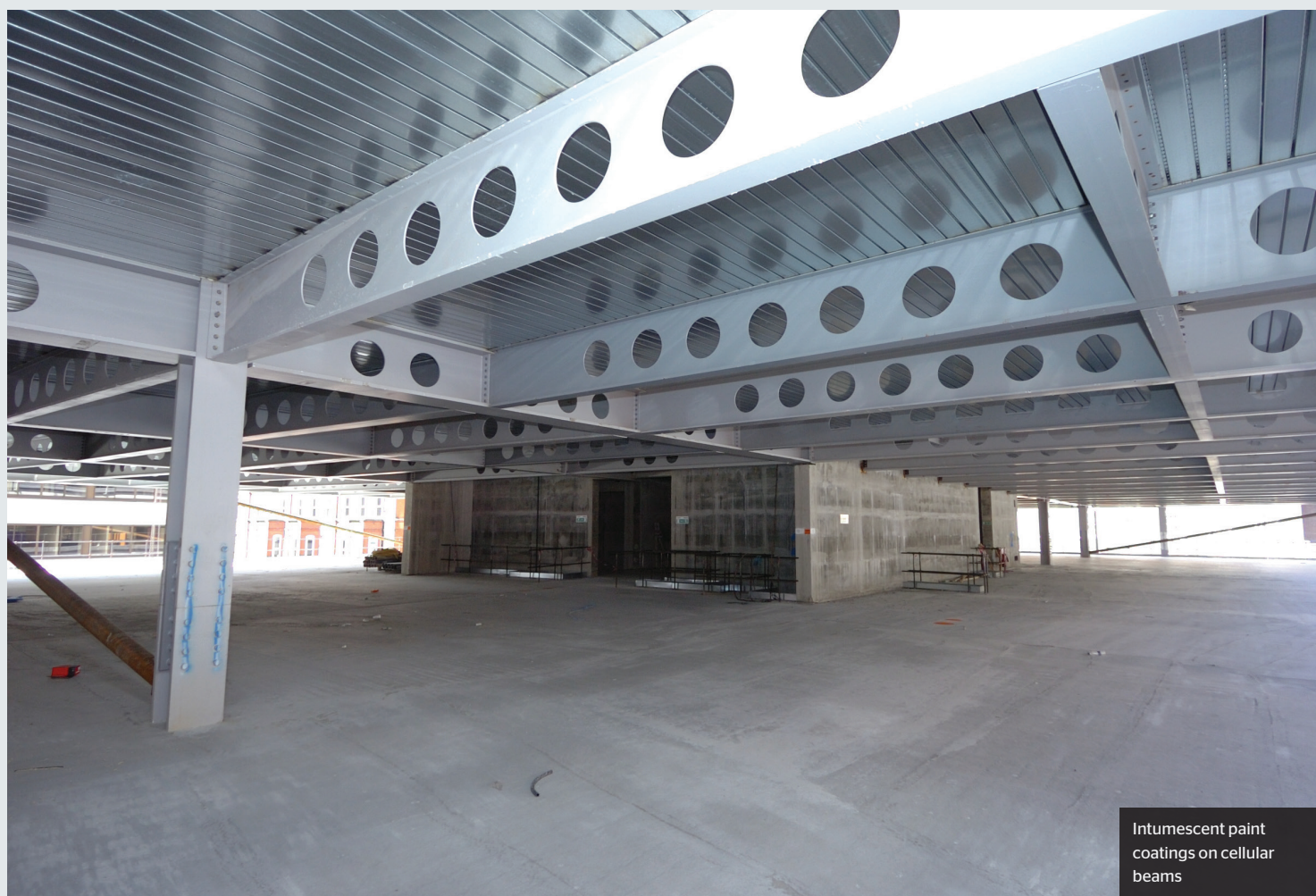
Intumescent paint coatings on cellular beams