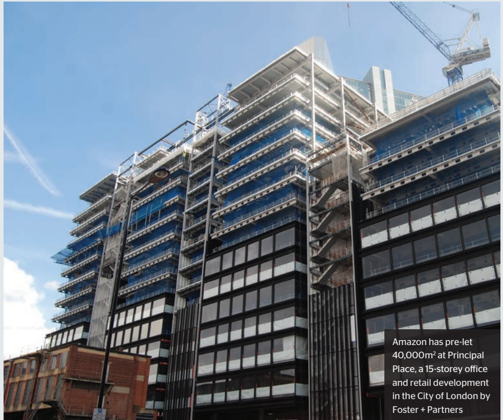
Amazon has pre-let 40,000m 2 at Principal Place, a 15-storey office and retail development in the City of London by Foster + Partners

It is still important at this stage in the design process to continue to determine and redress what has not been included within the drawings and ensure that these missing elements are taken into account. For example, the extent of secondary members should not be overlooked as these can account for a significant proportion of the overall steel piece count and cost.