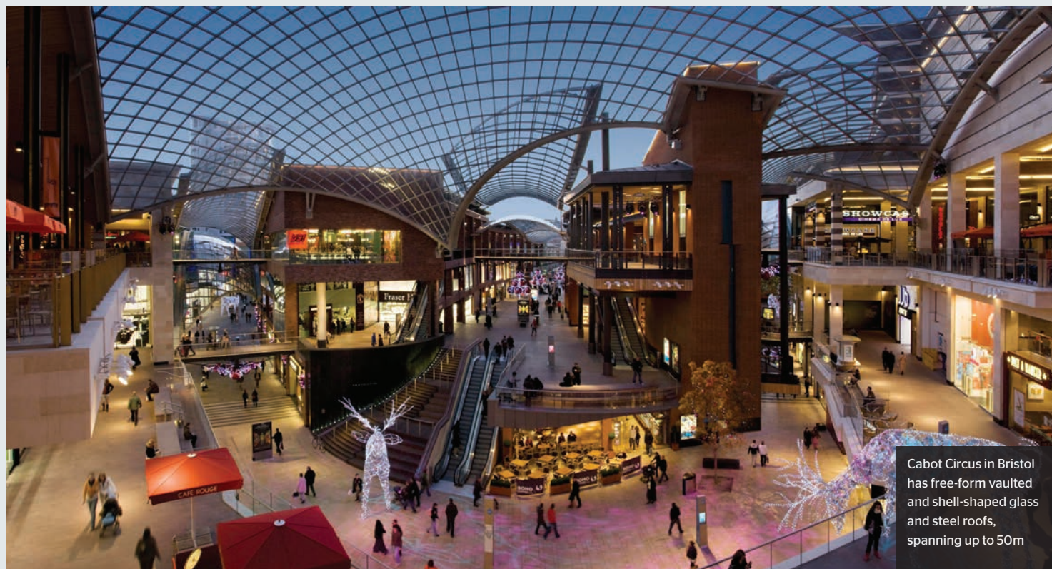
Cabot Circus in Bristol has free-form vaulted and shell-shaped glass and steel roofs, spanning up to 50m